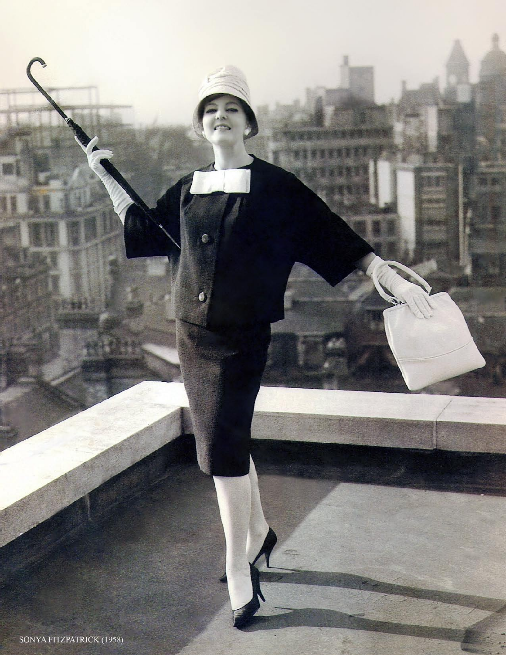
SONYA FITZPATRICK (1958)